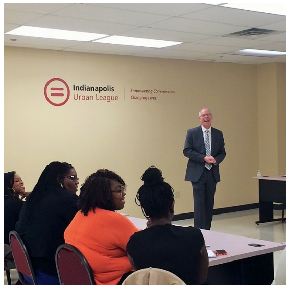
IULYP contributors meeting with IBJ 40 under 40 representative

Our contributors also had an opportunity to hear directly from 40 under 40 leadership about the selection process.