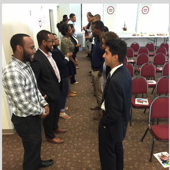
The Exchange Meeting at the Indianapolis Urban League Community Room (May 21, 2015)

Last Saturday, members of the Indianapolis Urban League Young Professionals, Keeping Indiana Beautiful, and Alpha Kappa Alpha Sorority, Inc., partnered with residents of Ransom Place Historic District to beautify a small pocket park on the corner of St. Clair and Camp Streets.