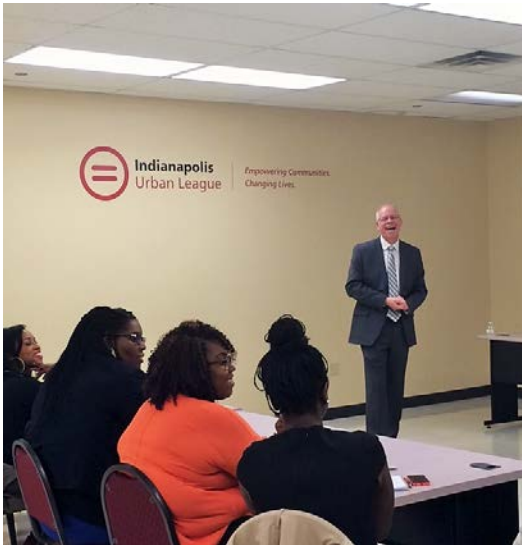
IULYP contributors meeting with IBJ 40 under 40 representative