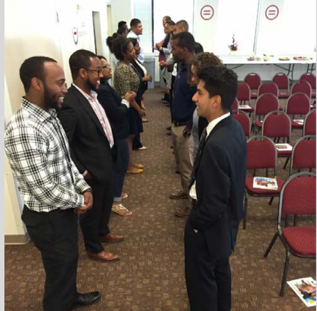
The Exchange Meeting at the Indianapolis Urban League Community Room (May 21, 2015)