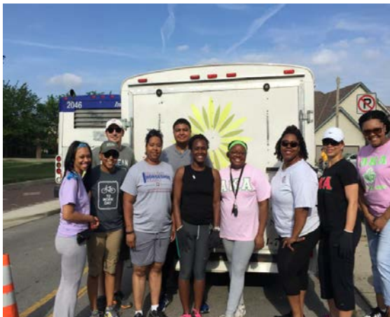
Members of The Exchange gearing up to put some sweat equity at the KIB pocket park project.

Last Saturday, members of the Indianapolis Urban League Young Professionals, Keeping Indiana Beautiful, and Alpha Kappa Alpha Sorority, Inc., partnered with residents of Ransom Place Historic District to beautify a small pocket park on the corner of St. Clair and Camp Streets.